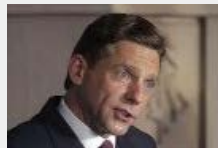
David Miscavige (DM) Chairman of the Board (COB) of RTC